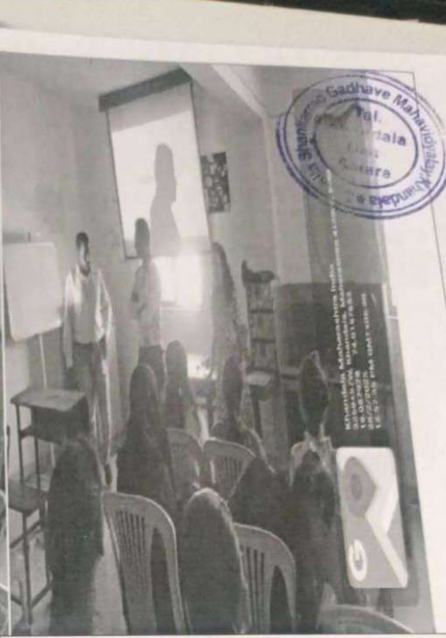
Guidance of Student