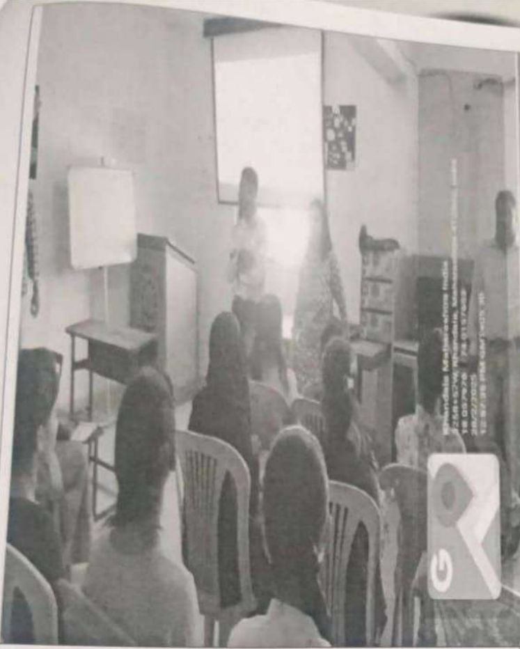
Introduction Of Lecture